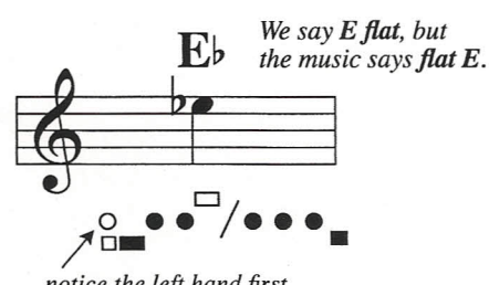
notice the left hand first finger is off for this note