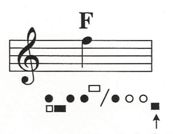
most notes on the flute have this key pressed with the right hand little finger